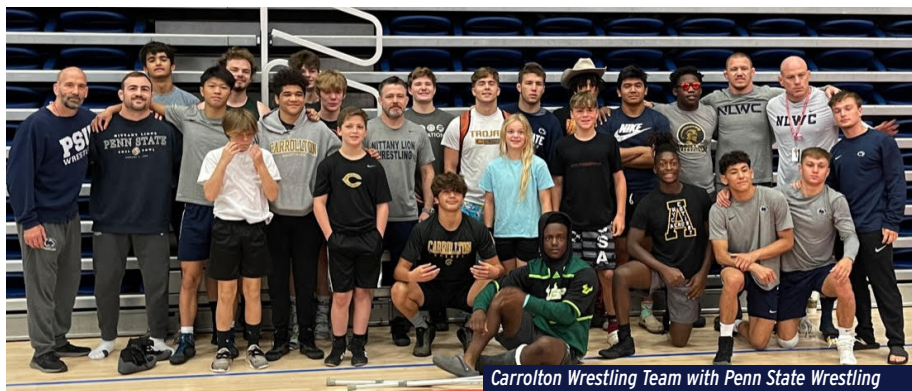
Carrollton Wrestling Team with Penn State Wrestling

Primary health insurance is a prerequisite. Camp participants will be covered by secondary accident insurance provided by the camp's tuition. The non-duplicating policy covers medical expenses within the range of its limits, except for those costs covered by any other valid and collectible insurance policies. No one will be admitted to the camp without a signed release and a primary insurance policy. Both must be provided on the application.