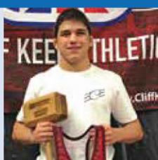
Yianni Diakomihalis, 2x World Champion