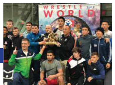
2019 Dual meet Champions – Team International

Hampton Inn & Suites Albany-Airport 45 British American Blvd. Latham, NY 12110 (518) 782-7500