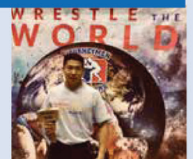
Bat-erdene Byambasuren of Mongolia, World Bronze Medalist