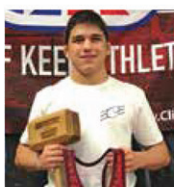
Yianni Kiakomihalis, 2x World Champion